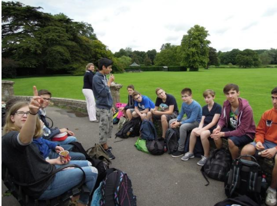
German students lunching at the Abbey Grounds