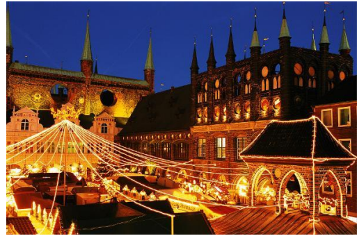
Lubeck Christmas Market