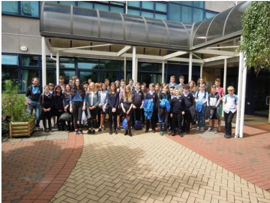
Cirencester Deer Park School

On 12 th July we had a great day welcoming 52 High School students and their teachers from Itzehoe. All of the students were hosted for half a day at Deer Park School, partnered up with a Deer Park pupil and attending their lessons and activities. Cirencester Twinning Association was thrilled to be able to find further opportunities within the town to introduce the students to Cirencester and a little more of British culture.